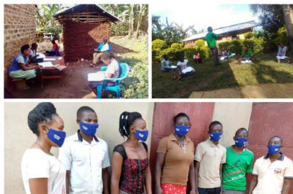
Home schooling programme initiated for upper primary pupils by the Uphill teaching team (June-September 2020)