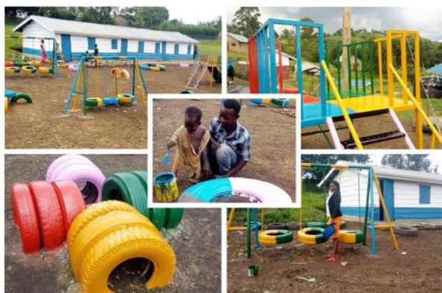
Kindergarten playground relocated & extended with more play equipment & tyre planters (Sept/Oct 2020)