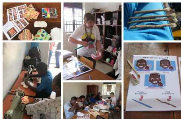
Workshops for staff: Making washable sanitary pad & school toothbrushing programme (Trustee visit, February 2020)