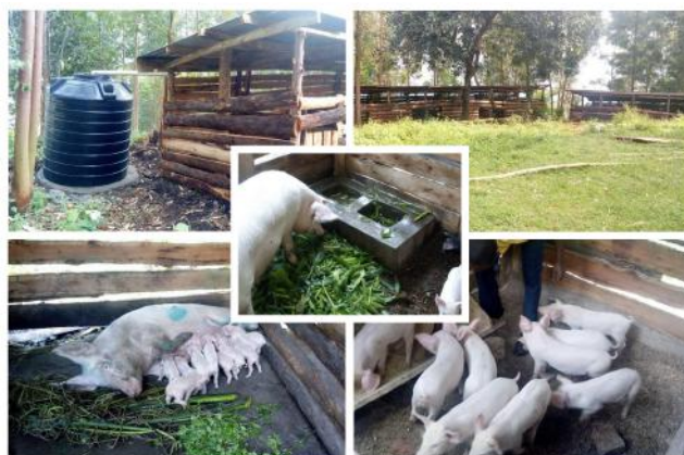
Uphill piggy project: Funding for construction, water harvesting, three pregnant sows & food (July 2020 onwards)