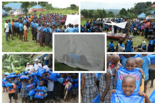
Mosquito net training & distribution (Trustee visit, February 2020)