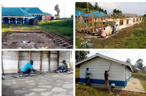
Kindergarten classrooms relocated to a newly fenced site & upgraded for longer term use (May 2020)