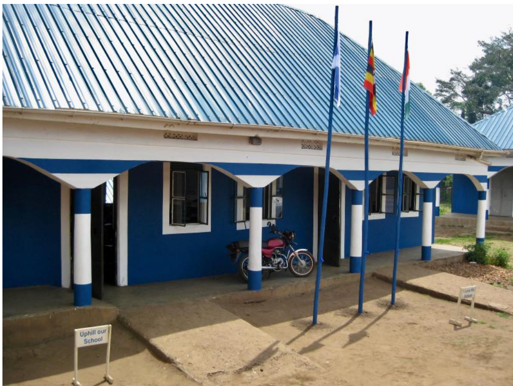
The Uphill flagpole celebrates the support the school has received from Scottish and Irish supporters over the years