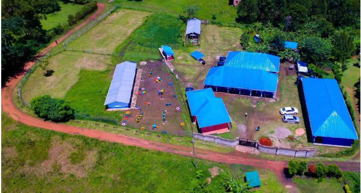
Aerial view of Uphill Junior School in November 2020, showing the newly relocated Kindergarten and playground on the left of the photograph