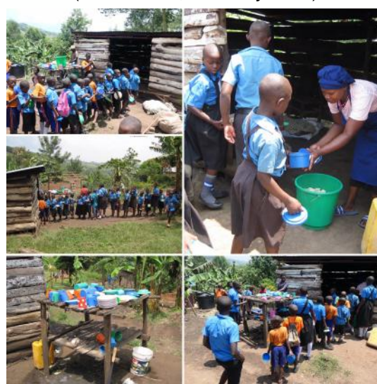
Pupil Support Fund payments include school fees, clothing, personal needs & school meals (February 2020)