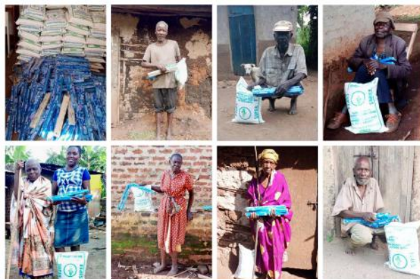
COVID-19 food relief programme for elderly & disabled in wider community (June 2020)