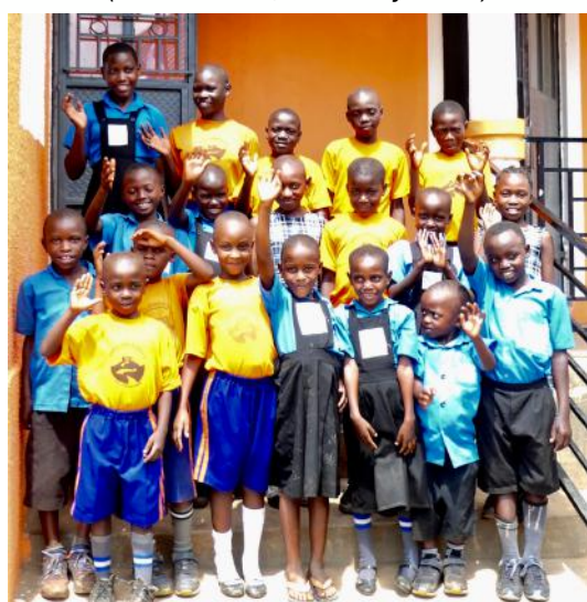
Children attending Uphill with help from the Pupil Support Fund (February 2020)