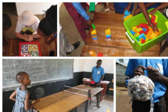
Introducing new games & pupil's homemade football (Trustee visit, February 2020)