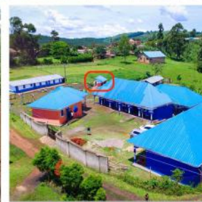
Hand washing station, fed from the school water harvesting system (August 2020)