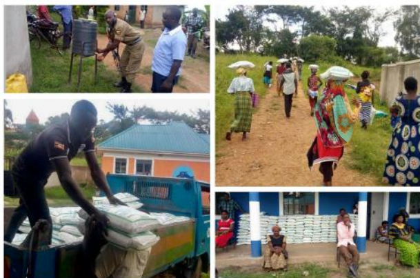
COVID-19 food relief programme for school families (May 2019)